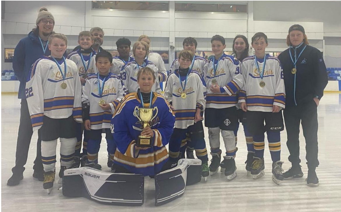
13U Peeewe Champions LCC Saints