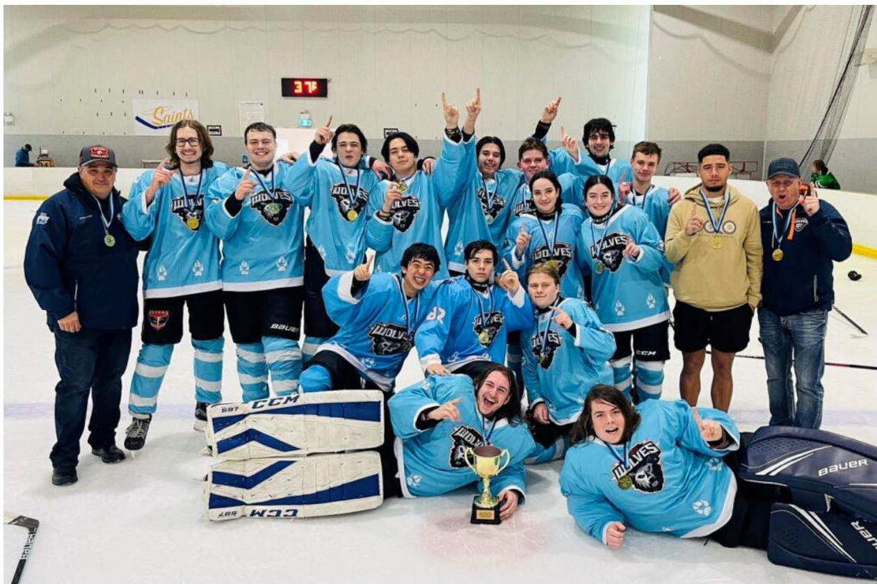
18U Midget Champions Ice Zoo Wolves