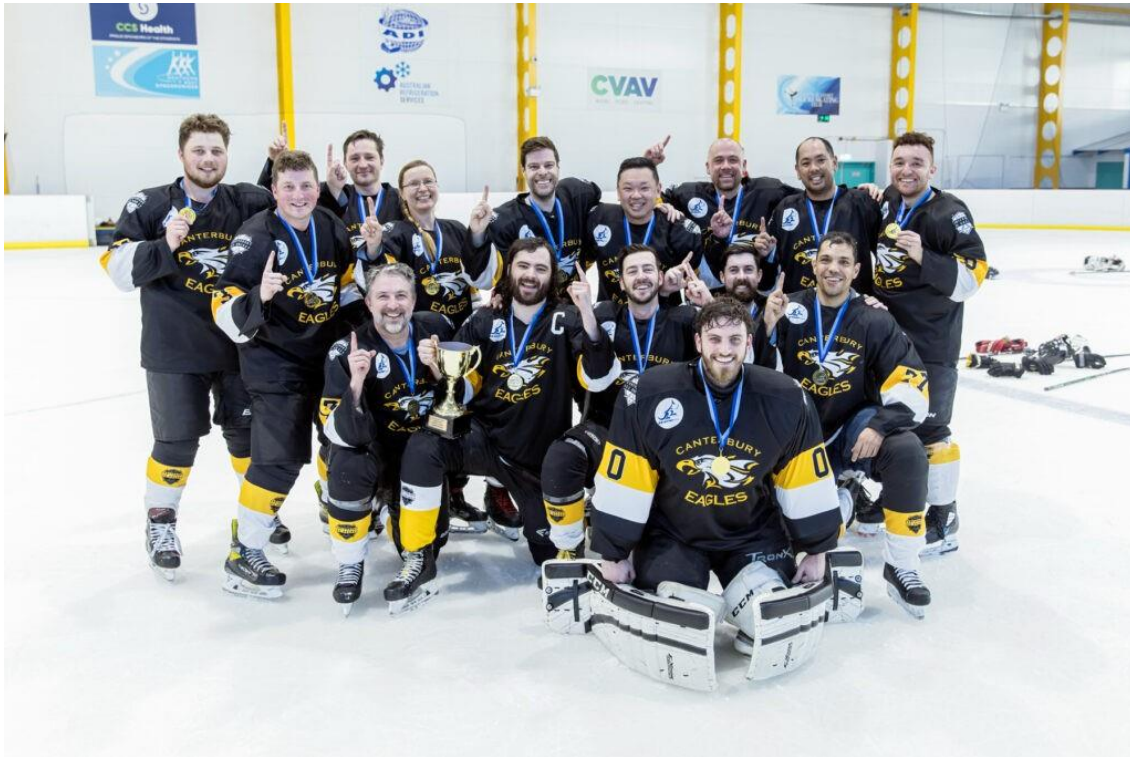
Senior 4 Champions Eagles 4