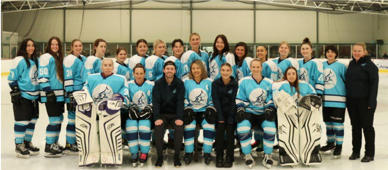
Womens Boxall – WA April 20th-23rd 2023 – 4th place to NSW