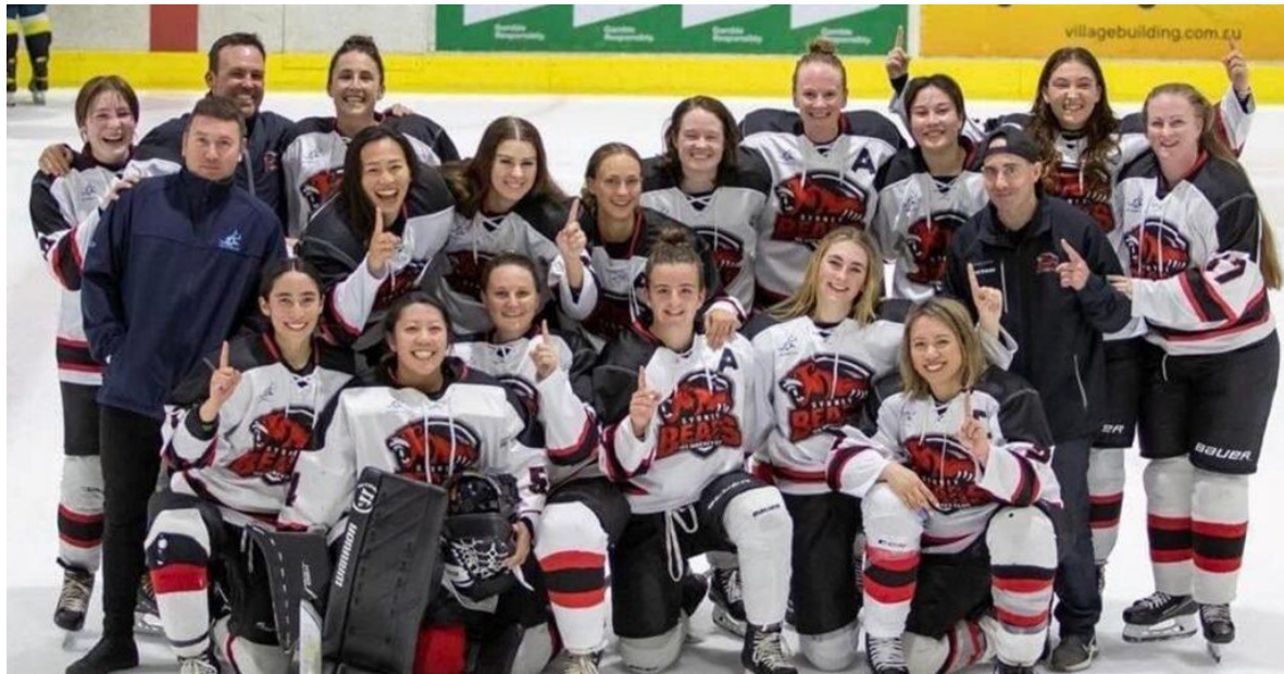
Womens Champions Sydney Bears