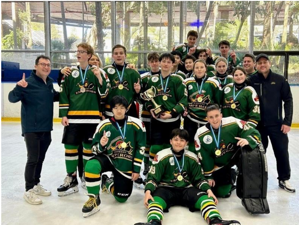
15U Bantam Champions Norwest Emperors