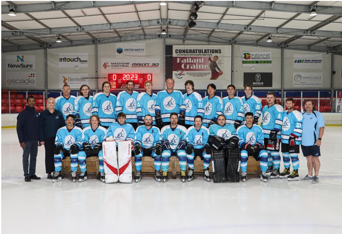
Open 17+ Brown – NSW November 9th-12th 2023 – SILVER Medal to NSW