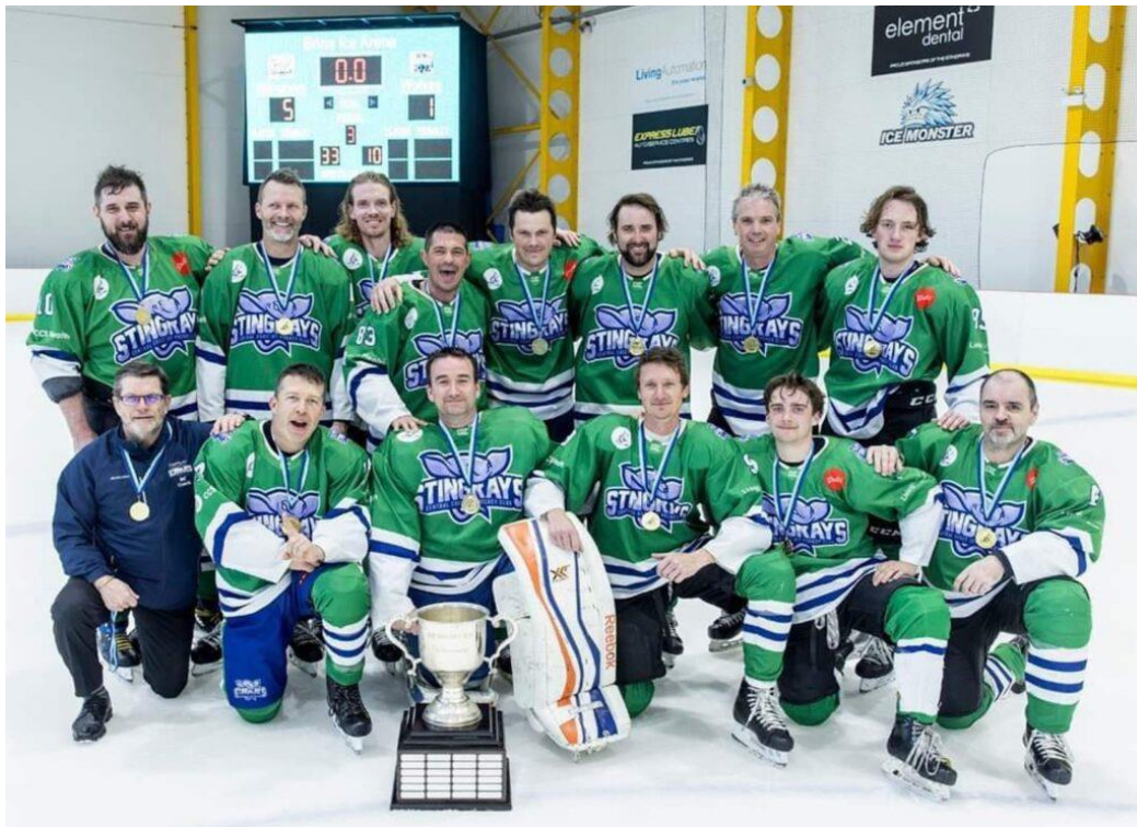
Senior 1 Champions Stingrays