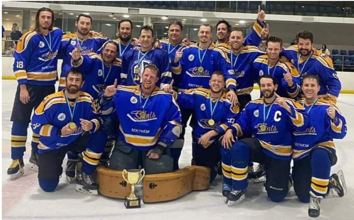
Senior 2 Champions Friars