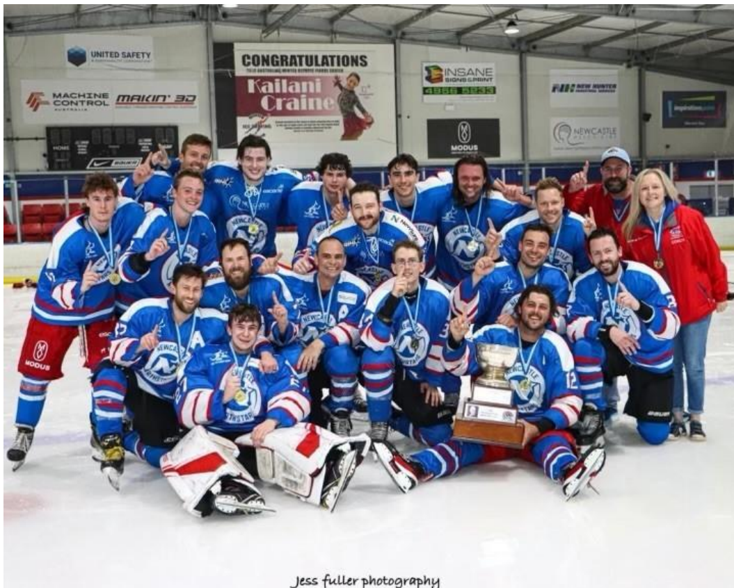
ECSL Champions North Stars