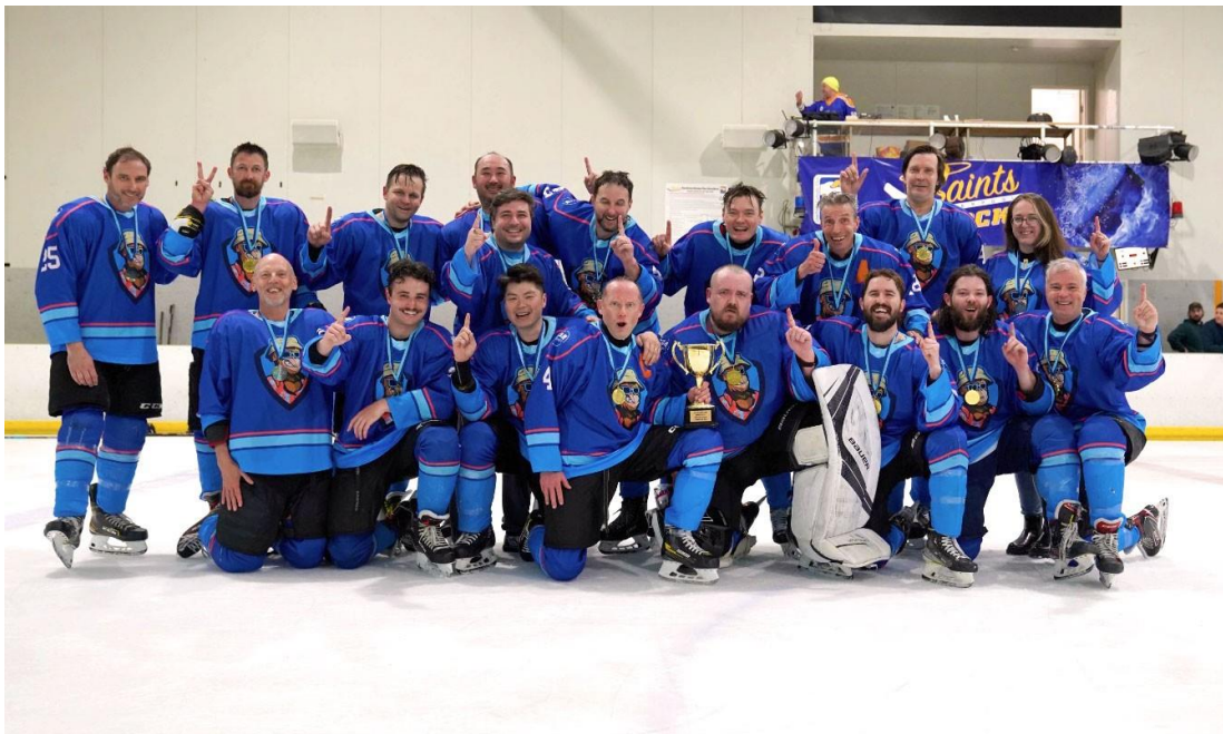
Senior 3 Champions Apes